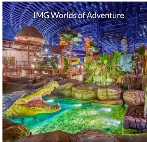
IMG Worlds of Adventure