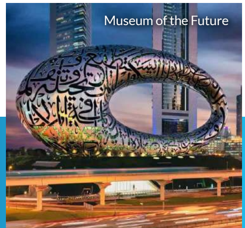
Museum of the Future

These are just a few highlights, as Dubai offers a wide range of attractions and experiences for visitors of all interests.