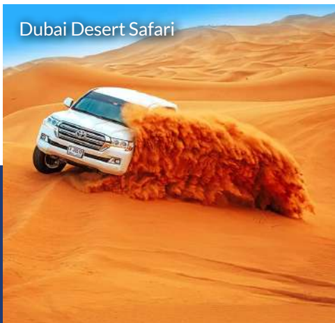
Dubai Desert Safari