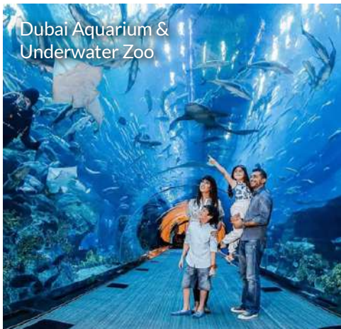
Dubai Aquarium & Underwater Zoo