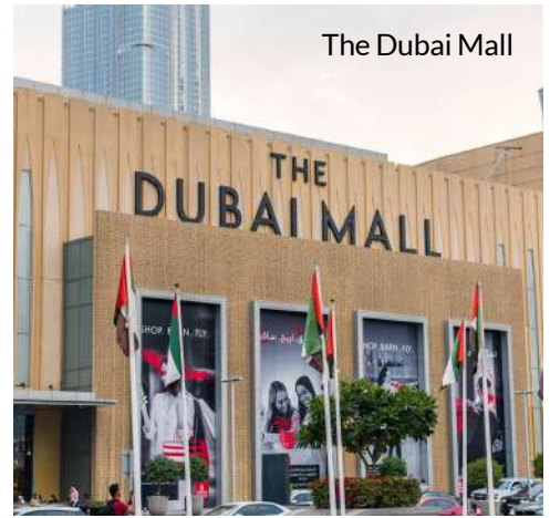
The Dubai Mall