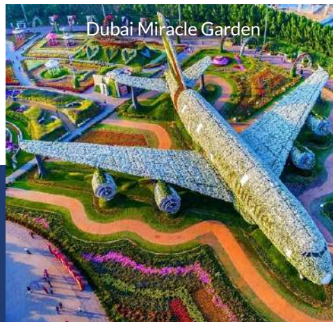
Dubai Miracle Garden